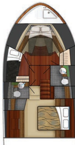
Lower Floor Plan with Optional 3rd Stateroom