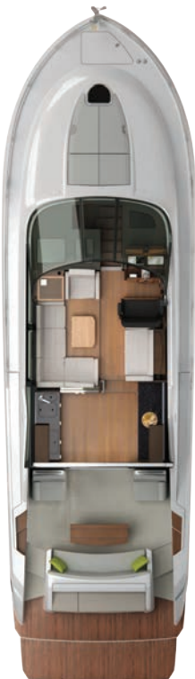
Standard Upper Salon, Galley & Cockpit Floor Plan