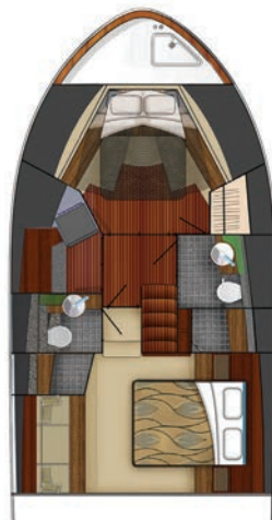
Standard Lower Floor Plan